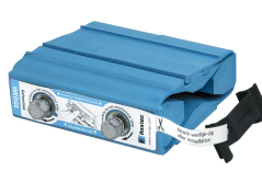
Wedge & Wedgekit